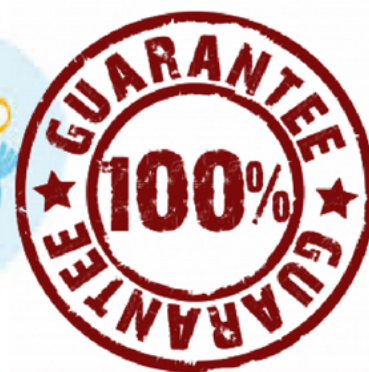
Digital marketing strategy